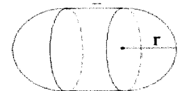
Picture of capsule